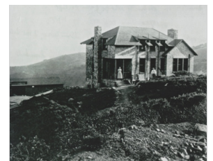
West Point Inn circa 1904 very little vegetation and no trees