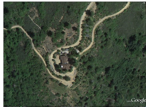
Showing areas of fire fuel reduction for Defensible Space 2017