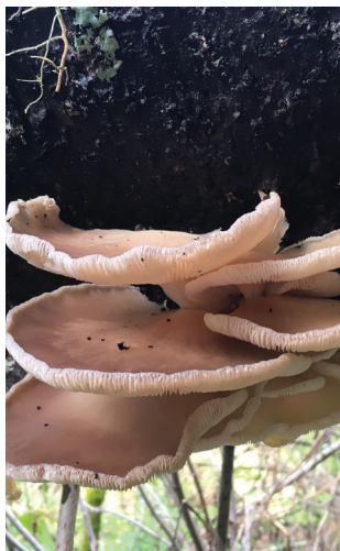
Steep Ravine Trail