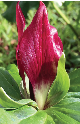
Trillium on Steep Ravine Trail

So happy we have had all this rainfall to nourish our garden paradise. Thank you Mother Nature and all who help nurture our garden.