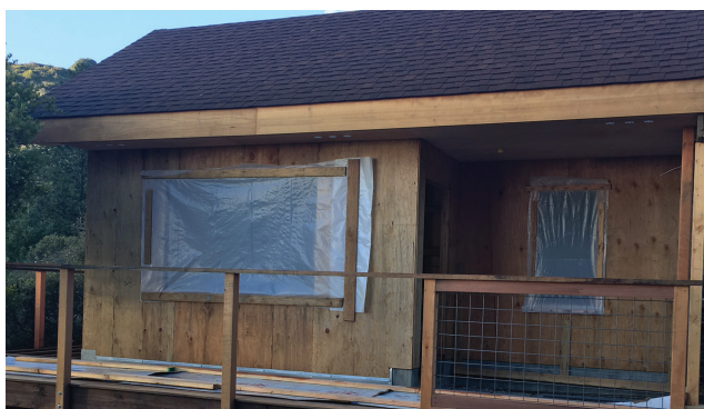
Progress on ADA Cabin